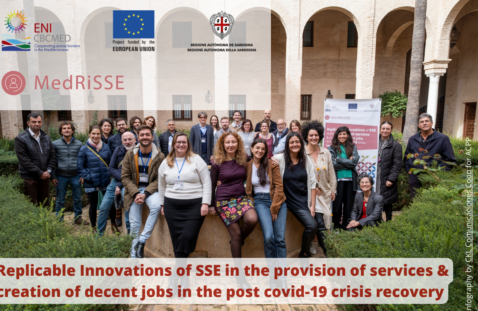
Infography by CKL Comunicaciones Coop for ACPP

MedRISSE is a social innovation initiative, led by the NGO Assembly of Cooperation for Peace (ACPP) , which aims to develop a Mediterranean scalability pathway for social innovations that enable the co-production of public services with local agents of the Social & Solidarity Economy (SSE) . The initiative was funded by the European Union under the European Neighbourhood Instrument for cross-border cooperation in the framework of the Mediterranean Basin Programme 2014-2020 (ENI CBC Med).